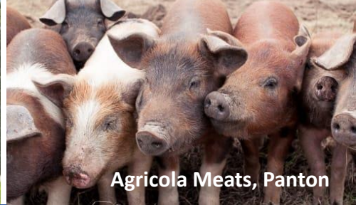
Agricola Meats, Pantton