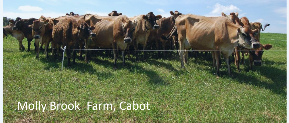
Molly Brook Farm, Cabot