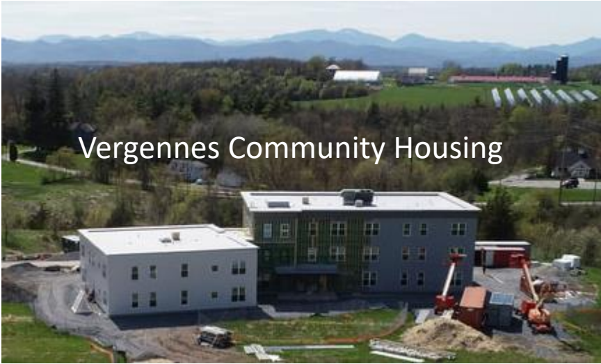
Vergennes Community Housing

VHCB leverages federal and private funds to create, preserve, and rehabilitate housing affordable to Vermonters.