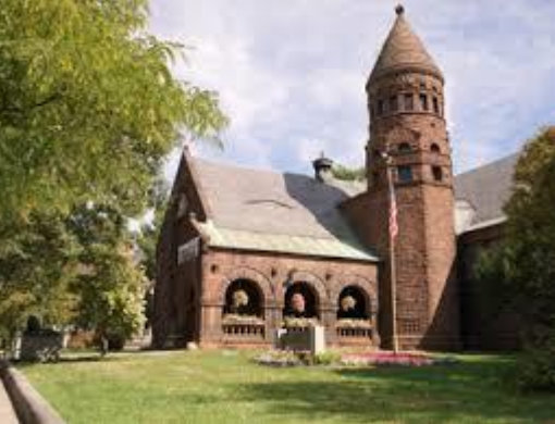
Fairbanks Museum, St. Johnsbury