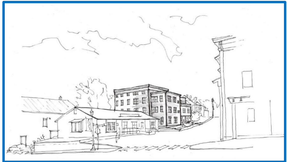
Village Center Apartments in Morrisville