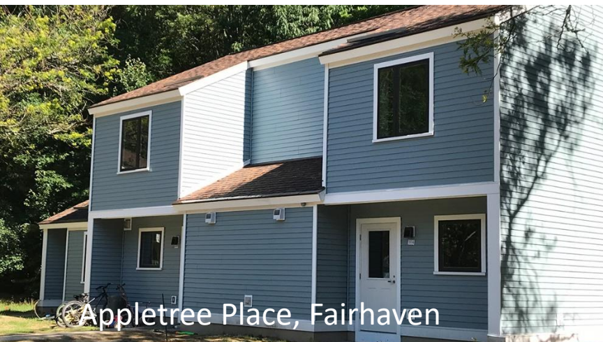
Appletree Place, Fairhaven