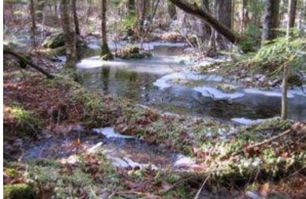
Roaring Brook, Vernon