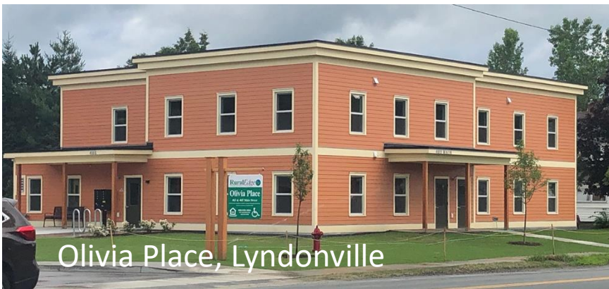
Olivia Place, Lyndonville

New affordable homes available soon in communities around the state: St. Albans, St. Johnsbury, Burlington, Shaftsbury.