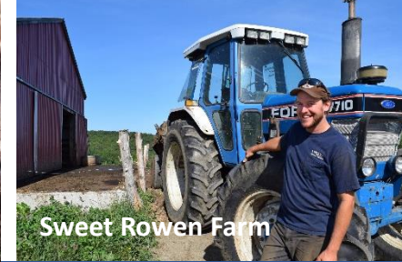
Sweet Rowen Farm