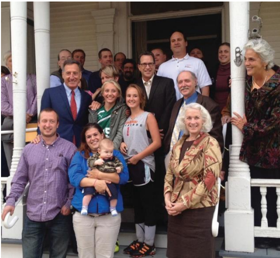
John Graham Shelter, Vergennes

Support services and rental assistance working with the Agency of Human Services, service and shelter providers, and state and local housing authorities.