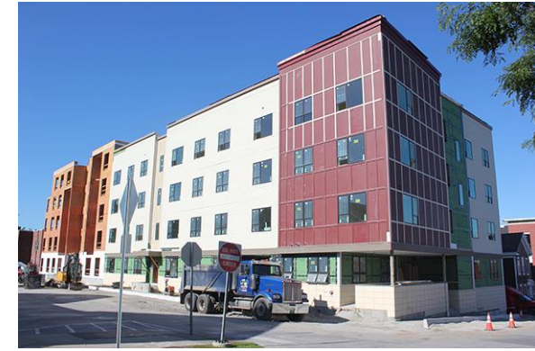
Congress St., St. Albans