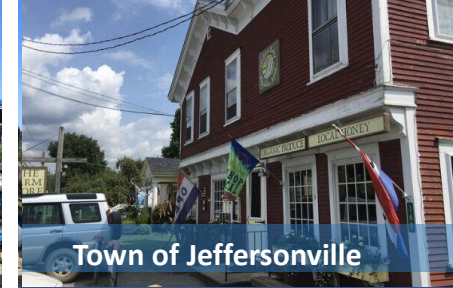
Town of Jeffersonville